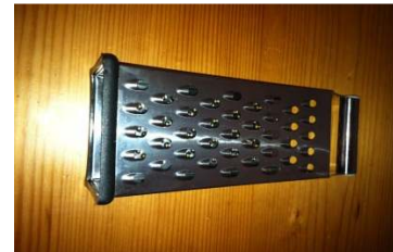
1 Cheese Grater