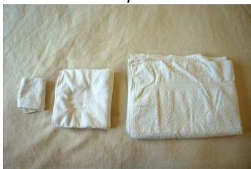
Towels 2 Big 2 Med 2 Sm