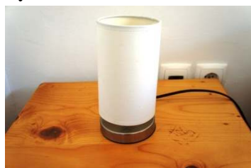
2 Bedside lights