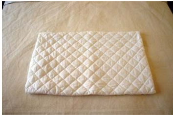
4 Pillo protectors