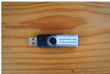
1 music collection