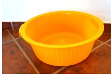
1 yellow bowl