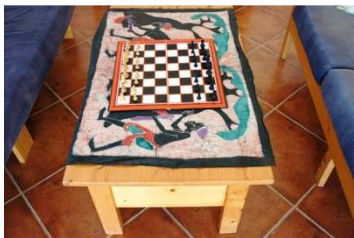
1 Coffee table