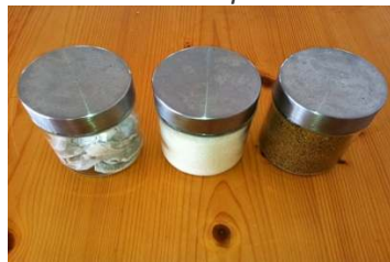
3 Storage jars