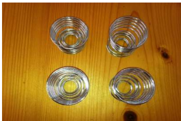
4 Egg cups