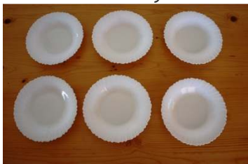
6 White soup dishes