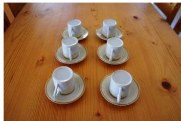
6 Coffee cups