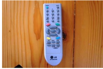
1 Remote for TV