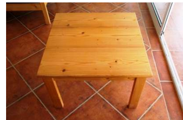
3 Square tables