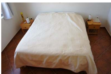
1 Double bed 190 x 160