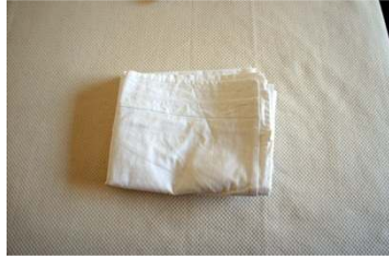
4 Pillow caces