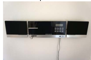
1 Sterio raidio CD player