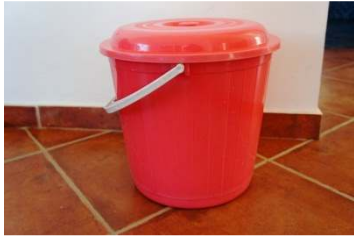
1 Waste bin