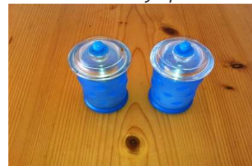
Salt and pepper