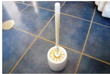
1 Toilet brush