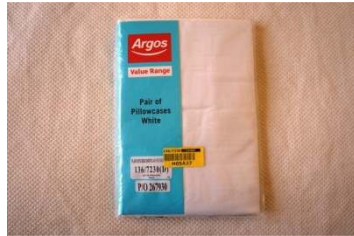
4 Pillow caces