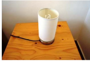
2 Bedside lights