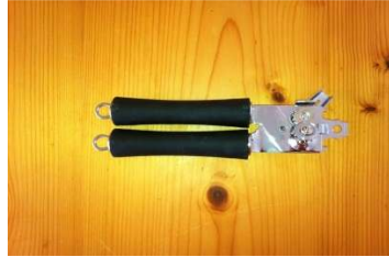
1 Tin opener