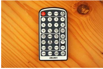
1 Remote for stereo