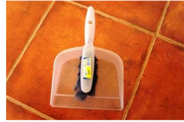
1 Dastpan & brush