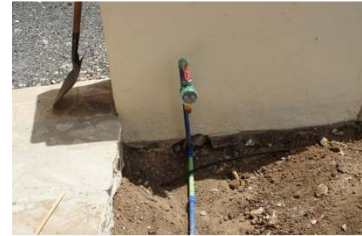
2 Water timers