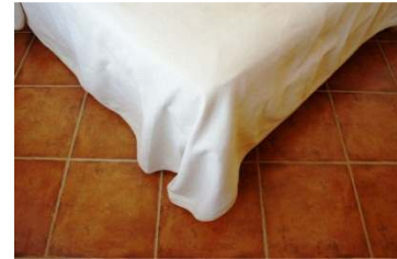
1 Double cover