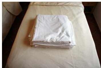
2 Double sheets