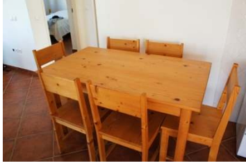
1 Wooden table 6 chairs