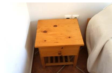
2 Bedside tabels