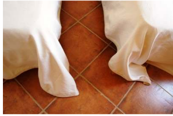
2 Single covers