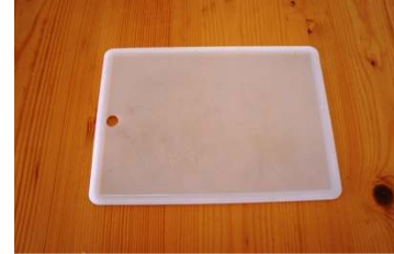
1 Chopping board