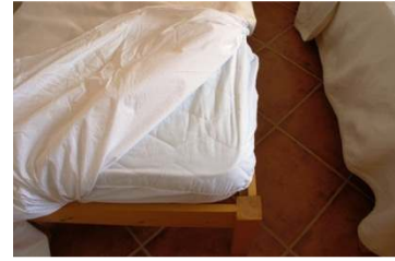
2 Single mattress protect