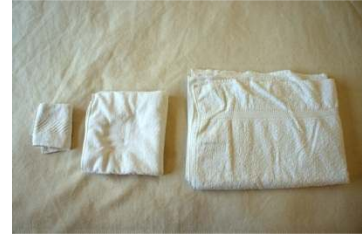
Towels 4 Big 4 Med 4 Sm