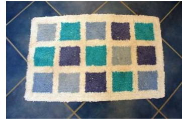
1 Shower mat