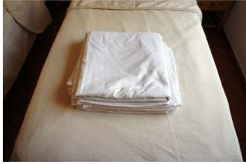
4 Single sheets