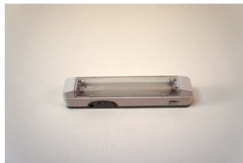
1 Emergancy light