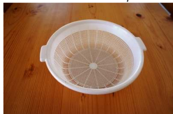
1 White plastic colander