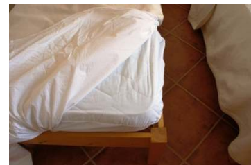
1 Double materess protect