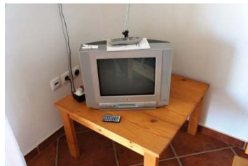
1 Television set 14"