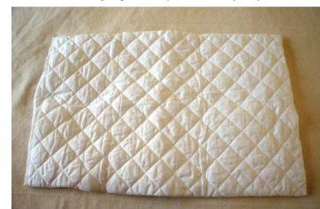
4 Pillow protectors