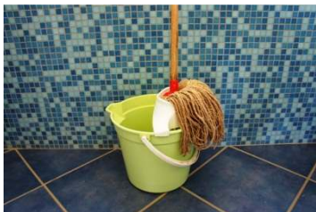
1 Bucket with mop