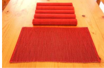
6 Small red mats