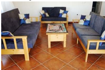
2 Sofas 1 Sofa bed