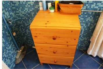
1 Set of draws