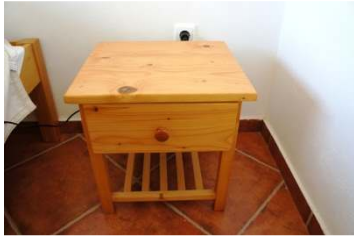
2 Bedside tabels