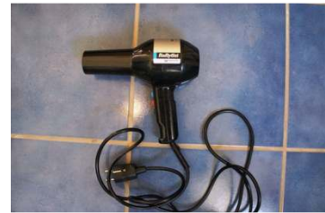
1 Hair drier