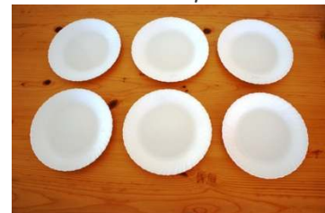
6 White flat plates