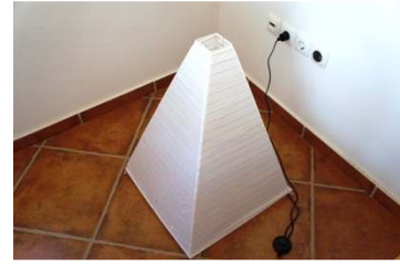
1 Pyramid light