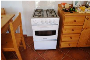
1 Gas oven