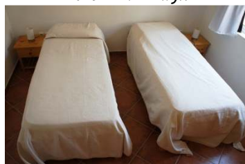
2 Single beds 180 x 90