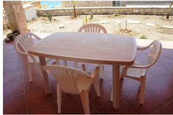
1 Table 4 chairs