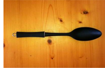
1 Serving spoon